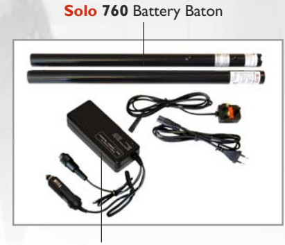
Solo 726 Fast Charger